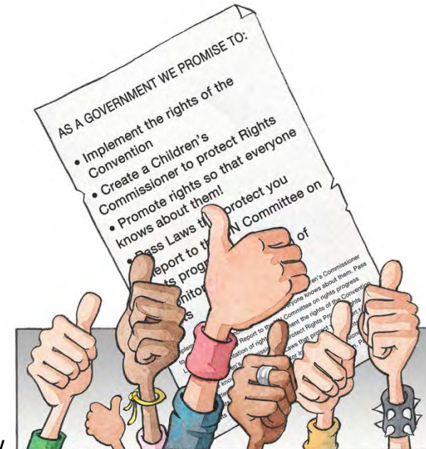
Article 4: The Government has promised to make rights a reality for all young people

How are UNCRC rights formally embedded within Scottish Legislation?